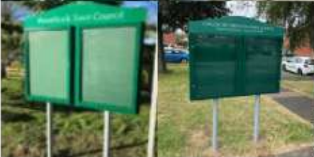
Classic Range - Image 4